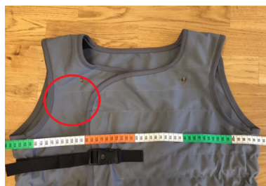
Measuring for the largest measurement for the size. None of the Velcro strip is visible.