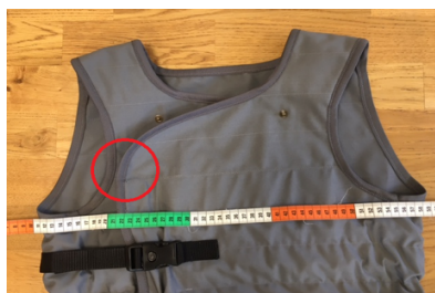
Measuring the smallest measurement for the size. No seam overlap.