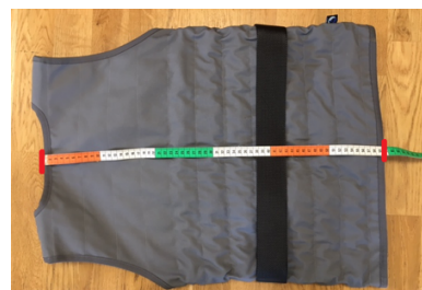
Measurement for the length at centre back.